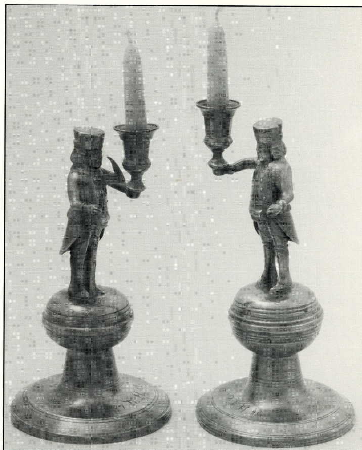
Catalogue No. 69