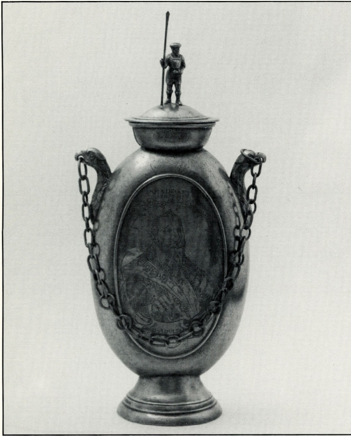
Catalogue No. 63