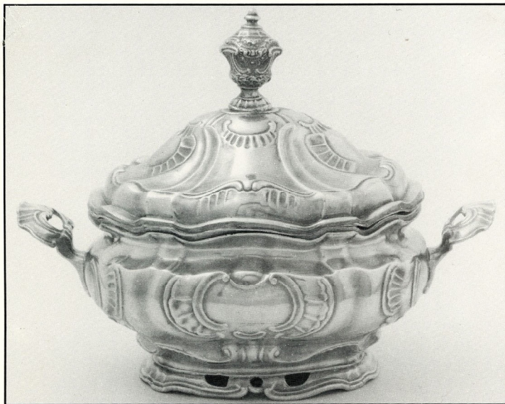
Catalogue No. 77