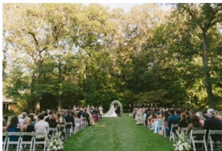
South Lawn - East