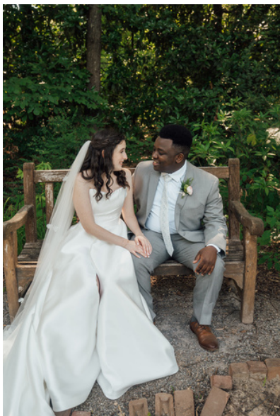
The Warmth Around You Photography