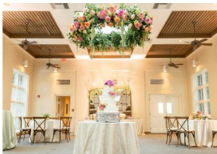
Hughes Pavilion indoor