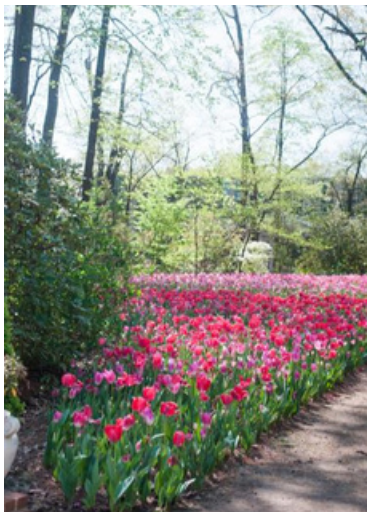
Morgan Newsome Photography