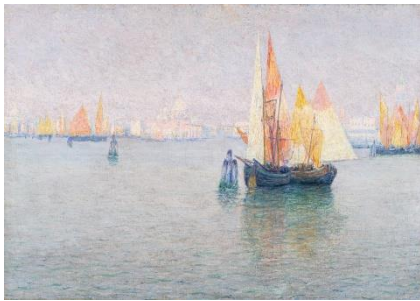
John Leslie Breck (American, 1860–99). The Bay at Venice, 1897, oil on canvas, 32 x 45 inches. Private Collection