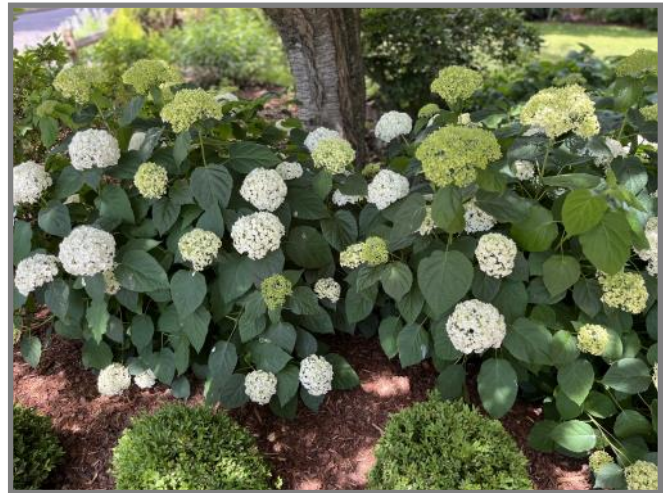
Hydrangea arborescens 'Annabelle'

The Hydrangea arborescens ('Annabelle') and the Hydrangea paniculatas , which both bloom on wood produced in the current year, will most definitely be providing wonderful blooms. Hydrangea serratas always known to be more bud hardy to the cold than the macrophyllas are blooming now. The most beloved of the hydrangeas, the macrophyllas are going to be hit or miss in the bud and bloom category this season. If you have a hydrangea that was a pass along plant from over 20 years ago you will most likely have no bloom this year. My heirloom 'Ayesha' survived but all growth above the soil line was killed and it will not have one bloom this year. If you are growing Hydrangea macrophyllas bred and brought in to the market within the last 10 years as remontant (reblooming), I think you have a chance of experiencing bloom. I have blooms on 'Azure Skies' and 'Froggy'. I'm still waiting to see if 'Bloomstruck' will display buds. I will fertilize it again but with a bloom booster hoping it may help. I grow the majority of my hydrangea macrophyllas in pots and many were moved into an unheated enclosed garage on the night of the polar plunge. Protected or not almost all macrophylla stems were killed back to soil level.