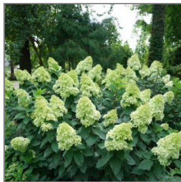
Hydrangea paniculata Limelight Prime®

New from Spring Meadow, Sky View™ is compact and a prolific bloomer (and re-bloomer)! The blooms emerge in a range of soft pastel colors and mature to blue. Good in a container or in your garden. 2-3' tall