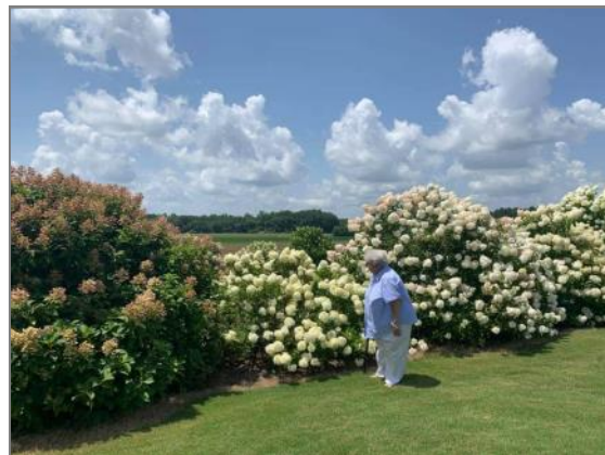
Jackson Experiment Station Hydrangea paniculata Field Trials July 2021

If you haven't visited the Experiment Station, plan to attend this year's Summer Celebration July 13 (details at https://westtn.tennessee.edu/summer-celebration/ ) for a day of tours, lectures, plant vendors and more!