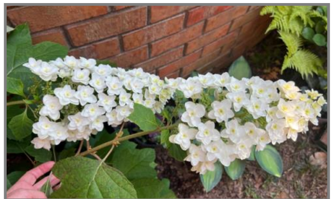
Hydrangea quercifolia blooms

As with the other woody plants, our hydrangeas were stung by the rapid temperature drop too. However, the hydrangeas we grow in our Mid-South area are root hardy and the vast majority have put out lush new green growth. The Hydrangea quercifolia (oak leaf) are going gang busters right now.