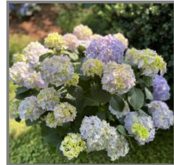
Hydrangea macrophylla Pop Star™ 2023 Introduction!

The newest entry in the Endless Summer series, Pop Star™ is indeed a star. Introduced by Bailey Innovations after 5 years of trials, it is the most compact and strongest rebloomer in the series. The blooms are an intense iridescent blue and will make a dramatic impact in your garden! 2-3' tall