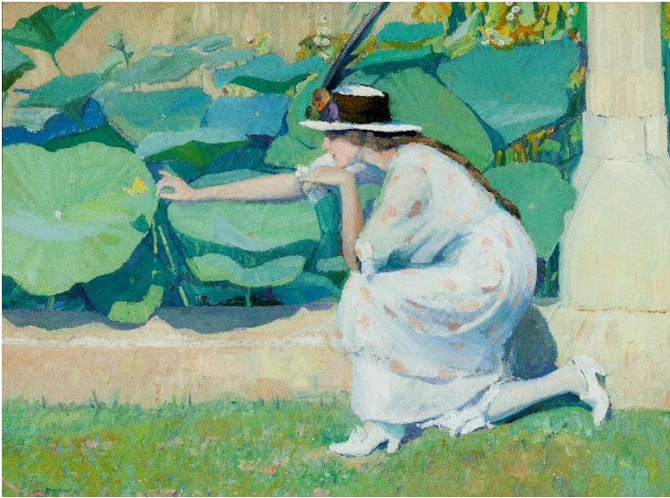
Jane Peterson American, (1876 – 1965) Lure of the Butterfly, ca. 1914 Oil on canvas 30 1/8 x 40 1/4 inches Museum purchase with funds provided by the 2020 Curator's Circle and the Dixon Gallery and Gardens Endowment Fund, 2020.1.2