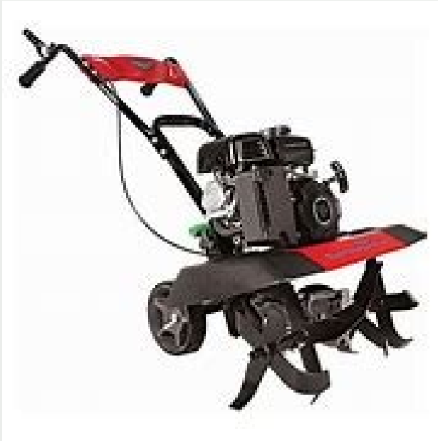
Front Tine Tiller vs Rear Tine Tiller